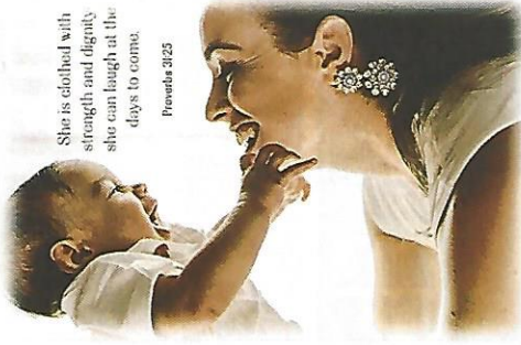
She is clothed with strength and dignity; she can laugh at the days to come.