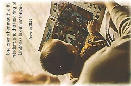
She opens her mouth with wisdom, and the teaching of kindness is on her tongue.