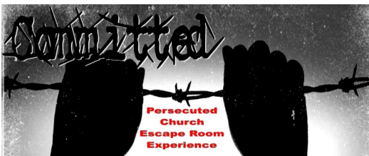
Alive Vineyard—7602 Stewart Road Newark, Ohio 43055—740.364.1750— www.alivevineyard.org

I hope you have signed up for “Committed” -our Escape Room experience. It is fun and challenging! Grab your friends now and get on the list as reservations are required!